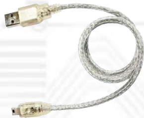
Y05-U04-060 (USB 2.0 A Male to B Mini 5 Pin Cable 60cm) x1

U.fl / IPX to RP-SMA female pigtail for wifi RF cable adapter