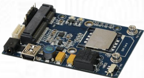
USBMI module (Wireless USB Mini Card Adapter ver1.3b)x1