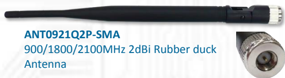
ANT0921Q2P-SMA 900/1800/2100MHz 2dBi Rubber duck Antenna