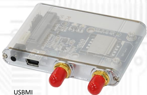
USBMI (Wireless USB Mini Card Adapter ver1.3b)x1