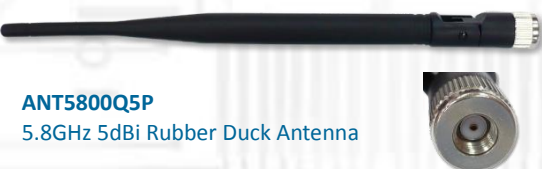
ANT5800Q5P 5.8GHz 5dBi Rubber Duck Antenna