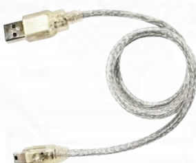
Y05-U04-060 (USB 2.0 A Male to B Mini 5 Pin Cable 60cm) x1