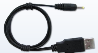
Y05-U17-060 (USB A Male to DC Power Cable) x1