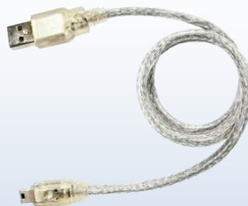
Y05-U04-060 (USB 2.0 A Male to B Mini 5 Pin Cable 60cm) x1