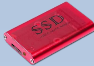
SSDMB V1.5 (mini-SATA to USB3.0 Adapter) X1