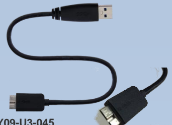
Y09-U3-045 (USB 3.0 A Male to Micro B Male 45cm Cable) x1