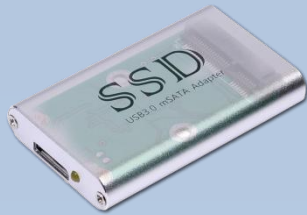
SSDMB V1.5 (mini-SATA to USB3.0 Adapter) X1