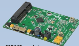
SSDMB module (mini-SATA to USB3.0 Adapter) x1