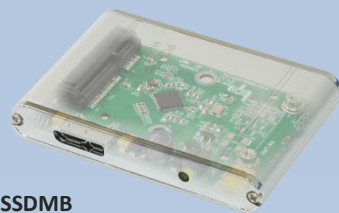
SSDMB (mini-SATA to USB3.0 Adapter) X1