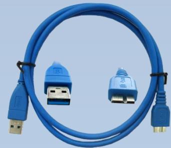
Y02-U3-150 (USB 3.0 A Male to Micro B Male 150cm Cable) x1

As a new manufacturer of quality computer connectivity products since 2009/Mar, BPLUS technology brings to market a broad range of upgrade products. These products bridge the connection between Desktop/Notebook systems and external peripherals.