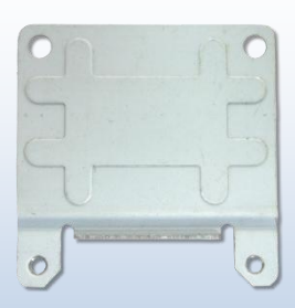
Metal Baffle x1 (Half to Full minicard bracket)