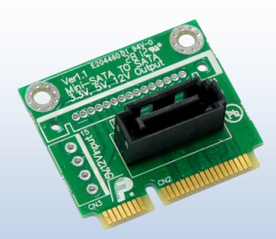
PMMD-C (SATA to half mSATA adapter) x1