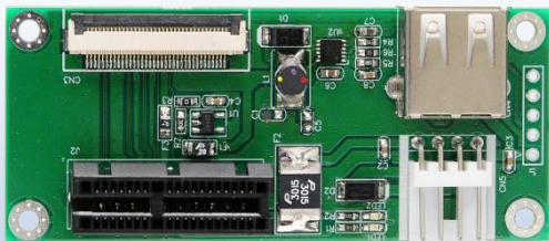
P24F PCIe x1 slot (edge) x1