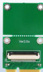
P24S mPCIe head (gold finger) x1