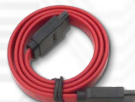
SATA cable x1