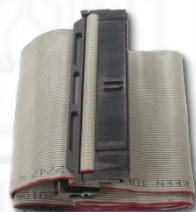
PATA cable x1