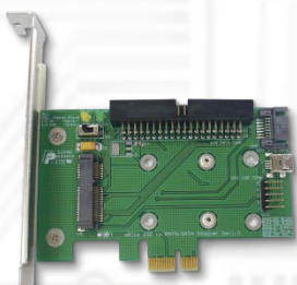
MP2S (mSATA to SATA /PATA adapter) x1