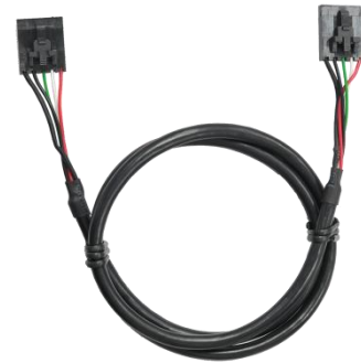
Y05-U2F-060 (Dupont 5PIN to dupont 5PIN USB cable) x1